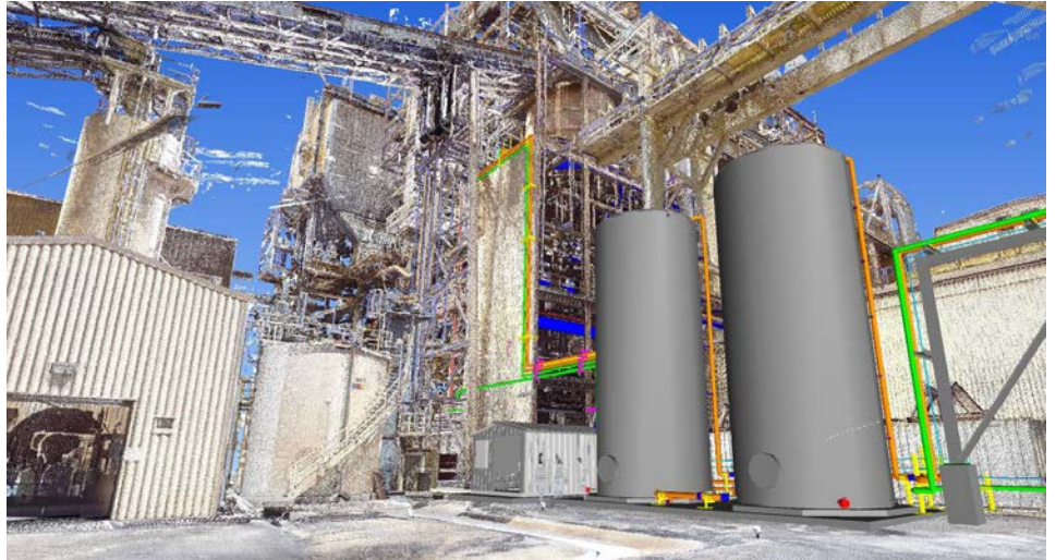
Using a combination of point cloud scan and CAD design, the team on this project determined the location of new equipment, routing of pipe, and placement of an unloading pad. While point cloud scans and 3D modeling can save projects time and money, if the process isn't planned for properly, it can create plenty of headaches.

In theory, and when it's executed well, 3D scanning saves both owners and their A/E/C firms time and money. It should also help